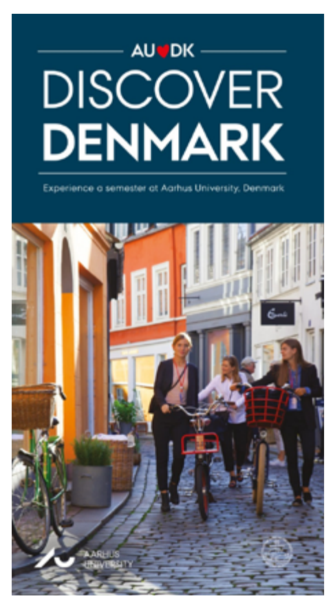
Cover page for a couple of our brochures